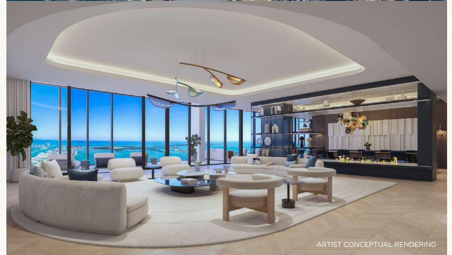
ARTIST CONCEPTUAL RENDERING