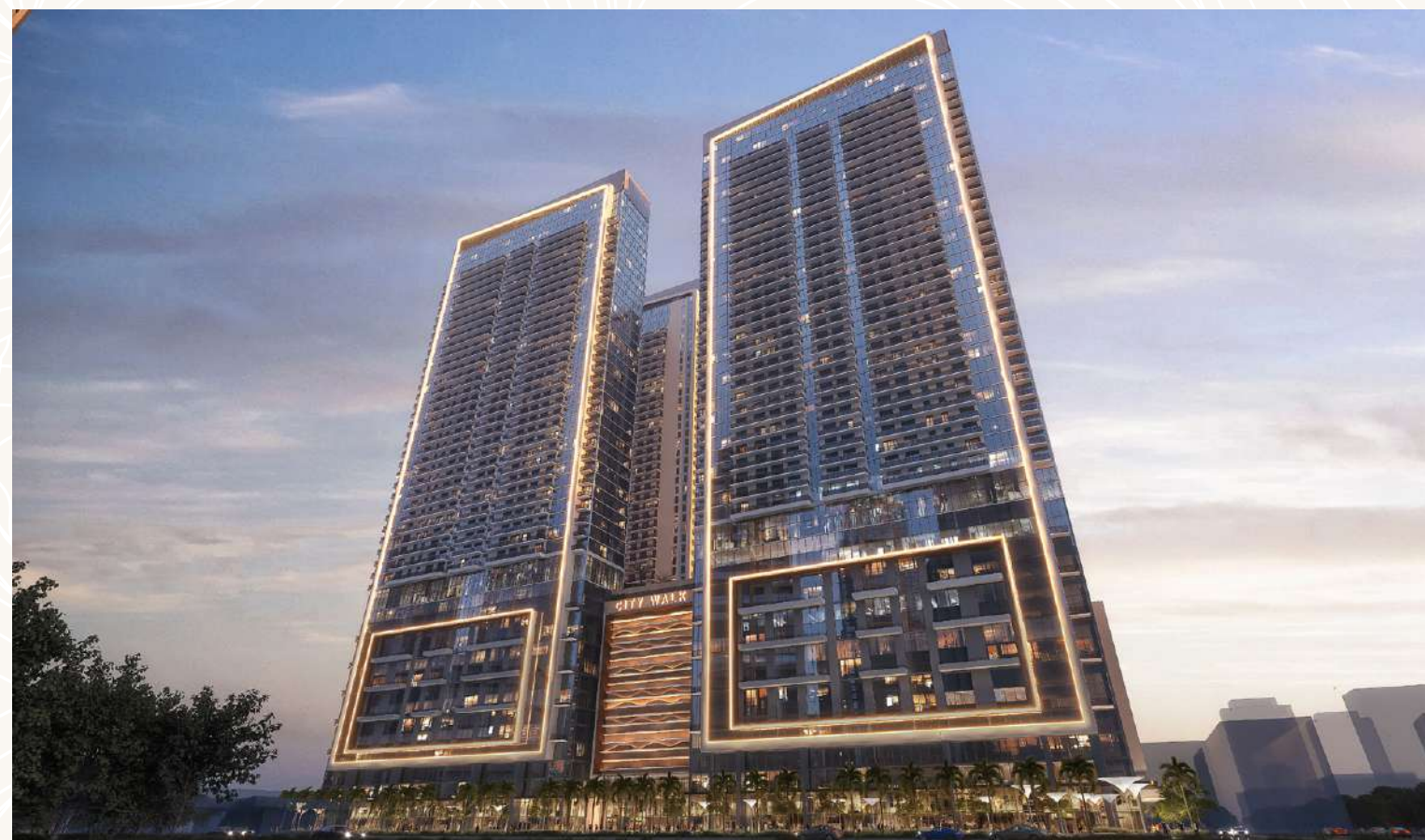
201 WEST BROWARD • FORT LAUDERDALE, FL

FSMY's deep history allows their knowledge base of codes, program, and detail to provide an invaluable level of quality with fewer challenges. FSMY's understanding of how important constant communication and the coordinated efforts of the team is, allows them to anticipate issues and add value to any Project. Their greatest satisfaction comes from providing an enjoyable and profitable experience for profitable for the entire team and establishing lasting relationships. What differentiates them is their 3D Modeling of Designs for coordination and client use as well as their in-house renderings and walkthroughs.