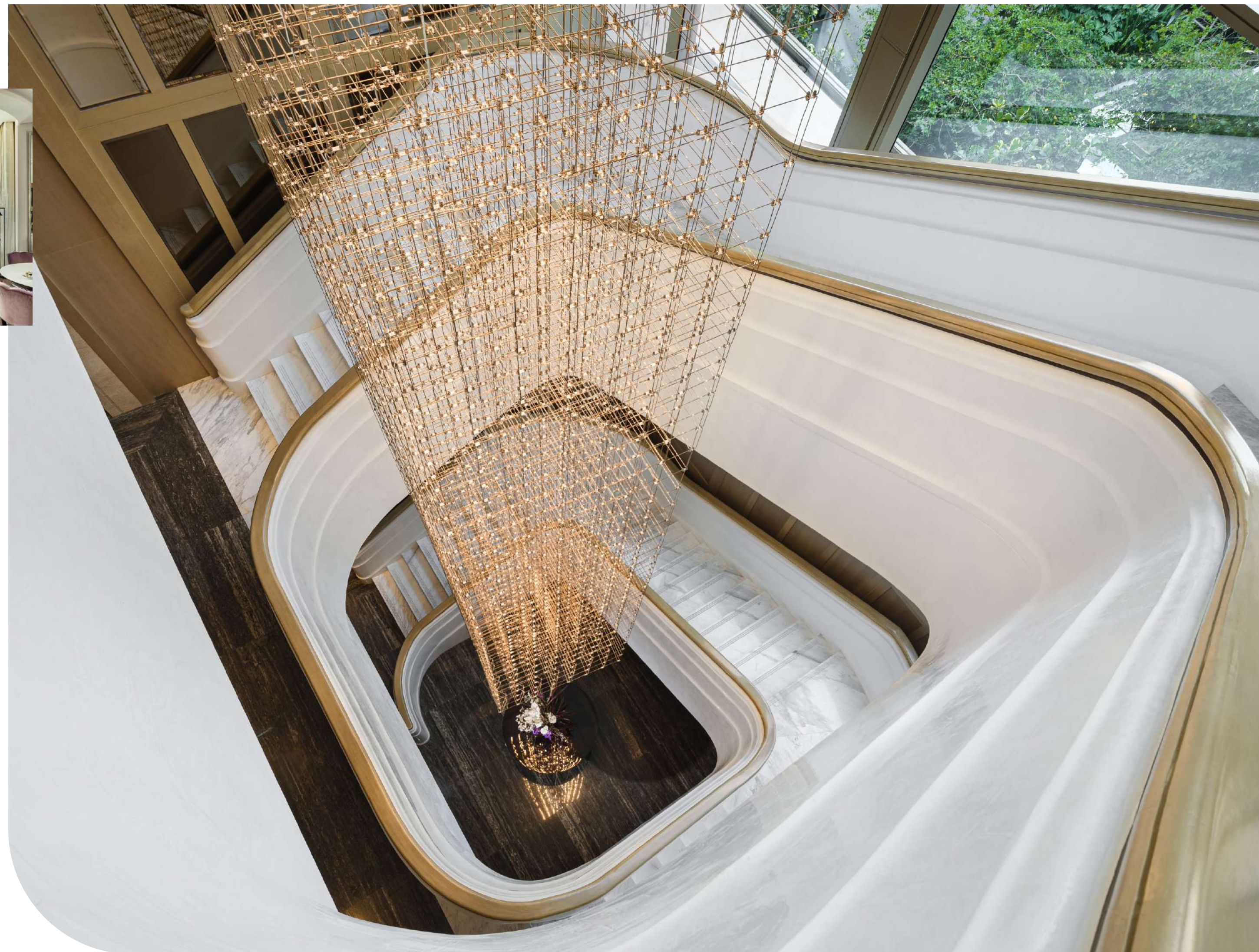
THE CAPELLA HOTEL BANGKOK

Drawing inspiration from the coastal locale, BAMO has masterfully crafted interiors that embody understated luxury and serenity. Interiors are meticulously curated with clean lines and tailored details, infused with hints of retro-inspired glamour, resulting in an ambiance of cool, classic elegance, refined comfort, and timeless sophistication.