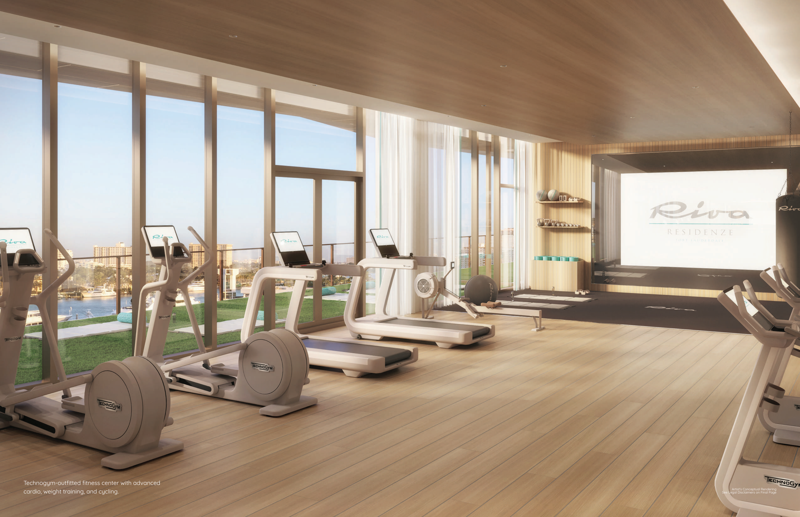
Technogym-outfitted fitness center with advanced cardio, weight training, and cycling.

Artist's Conceptual Rendering See Legal Disclaimers on Final Page