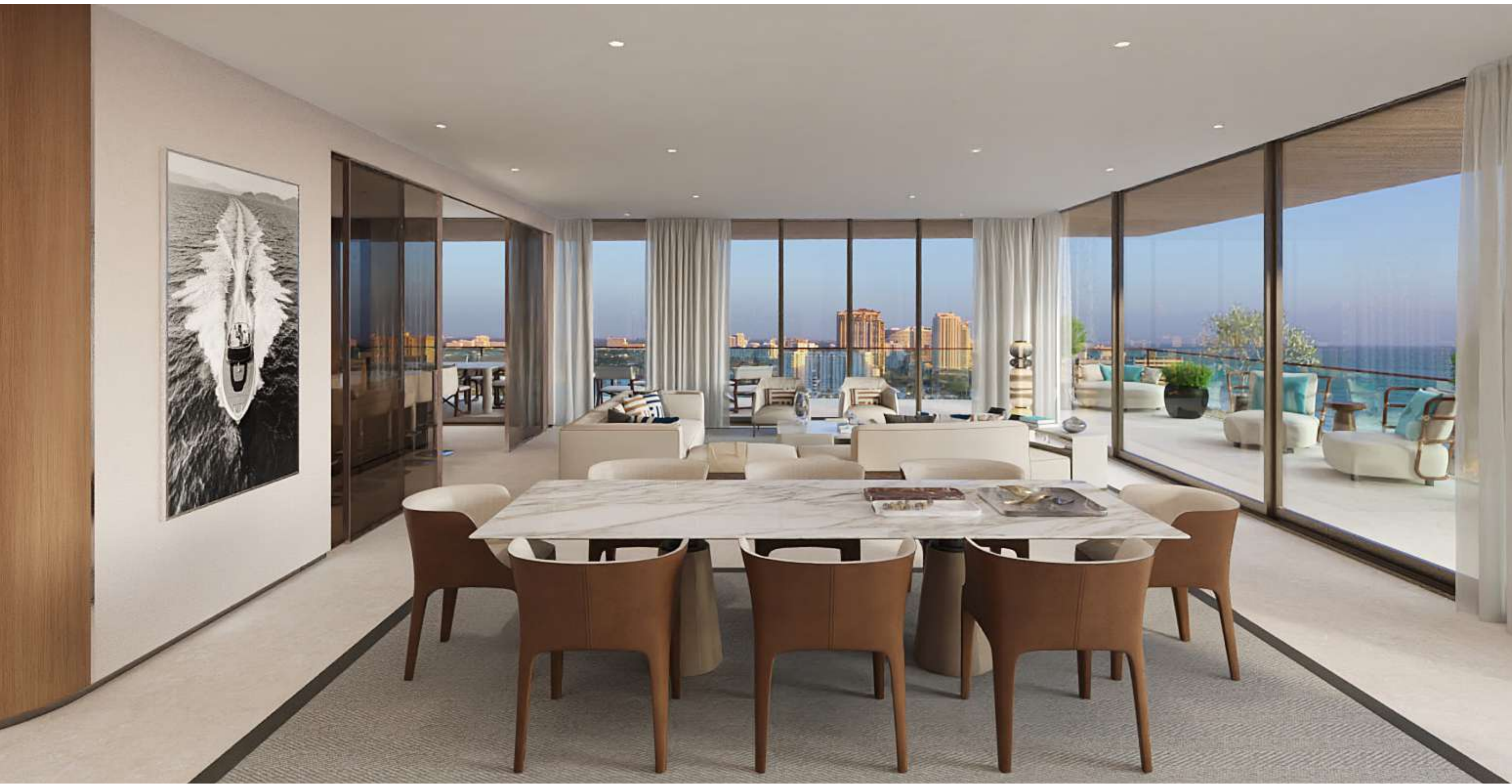
Spacious interiors seamlessly blend dining, lounging, and entertaining—framed by uninterrupted views of the Atlantic.