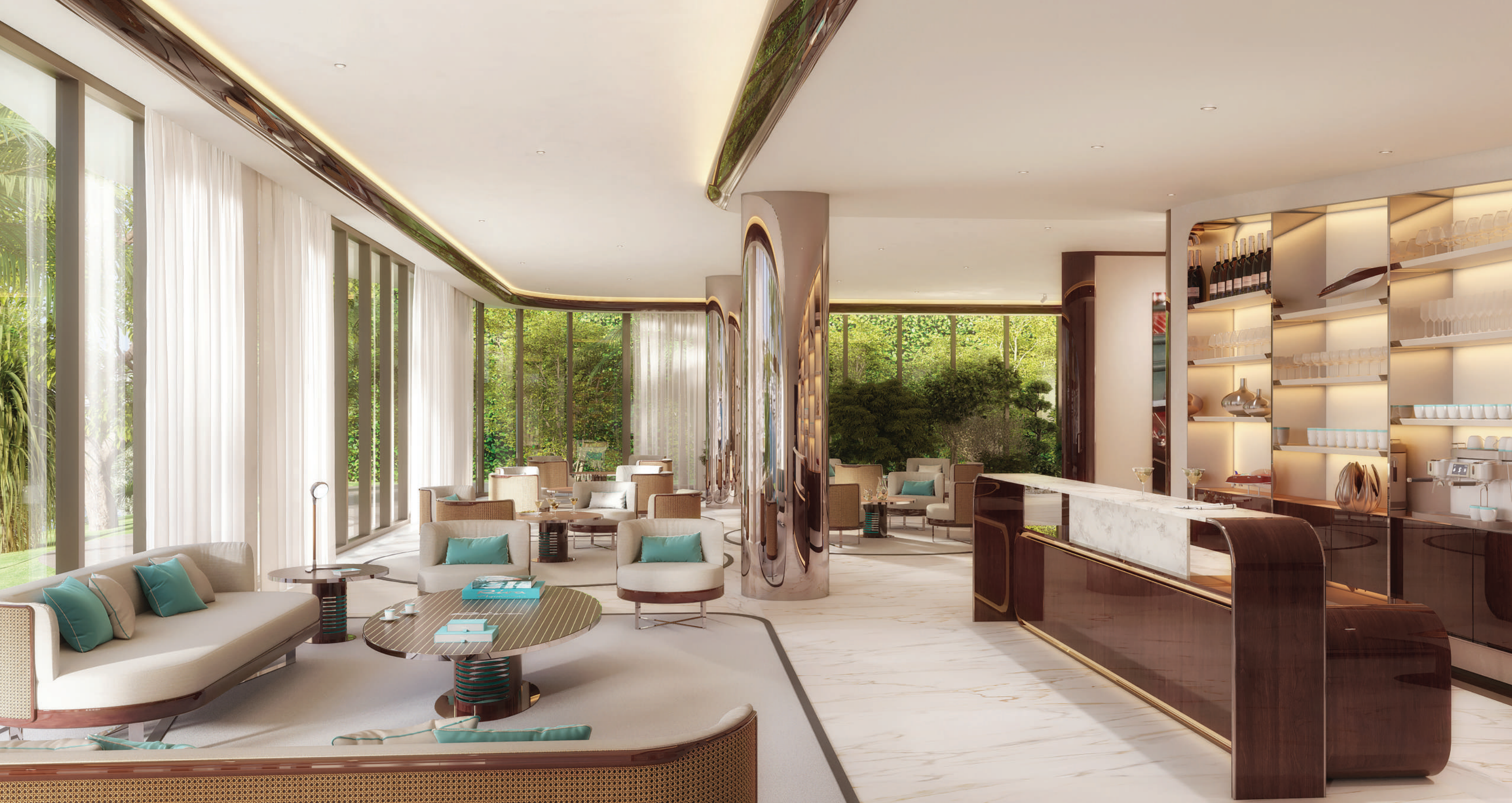
A spacious, inviting ground floor lobby and bar set the stage for intimate gatherings and meaningful conversations.