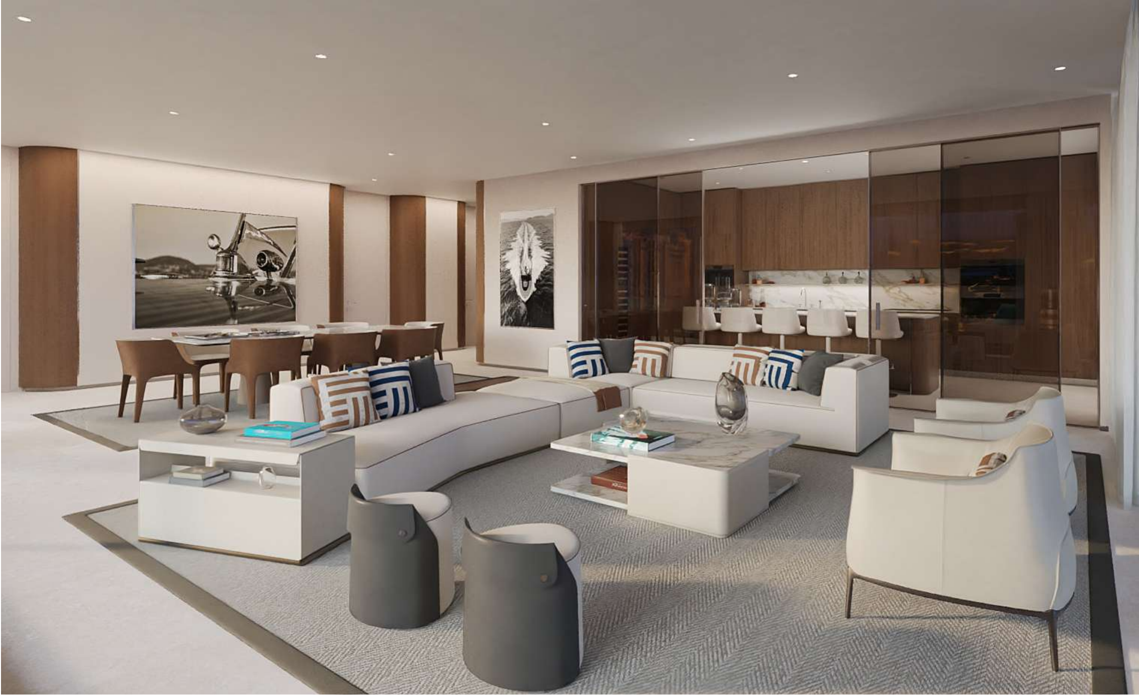
Welcoming living room for gathering and conversation.

Riva Residenze offers 36 two- to six-bedroom luxury residences with stunning oceanfront, marina, and city views. Here, home espouses the sensibility of the yachting lifestyle, interpreted in understated accents and a quiet, purposeful balance of lines and curves.