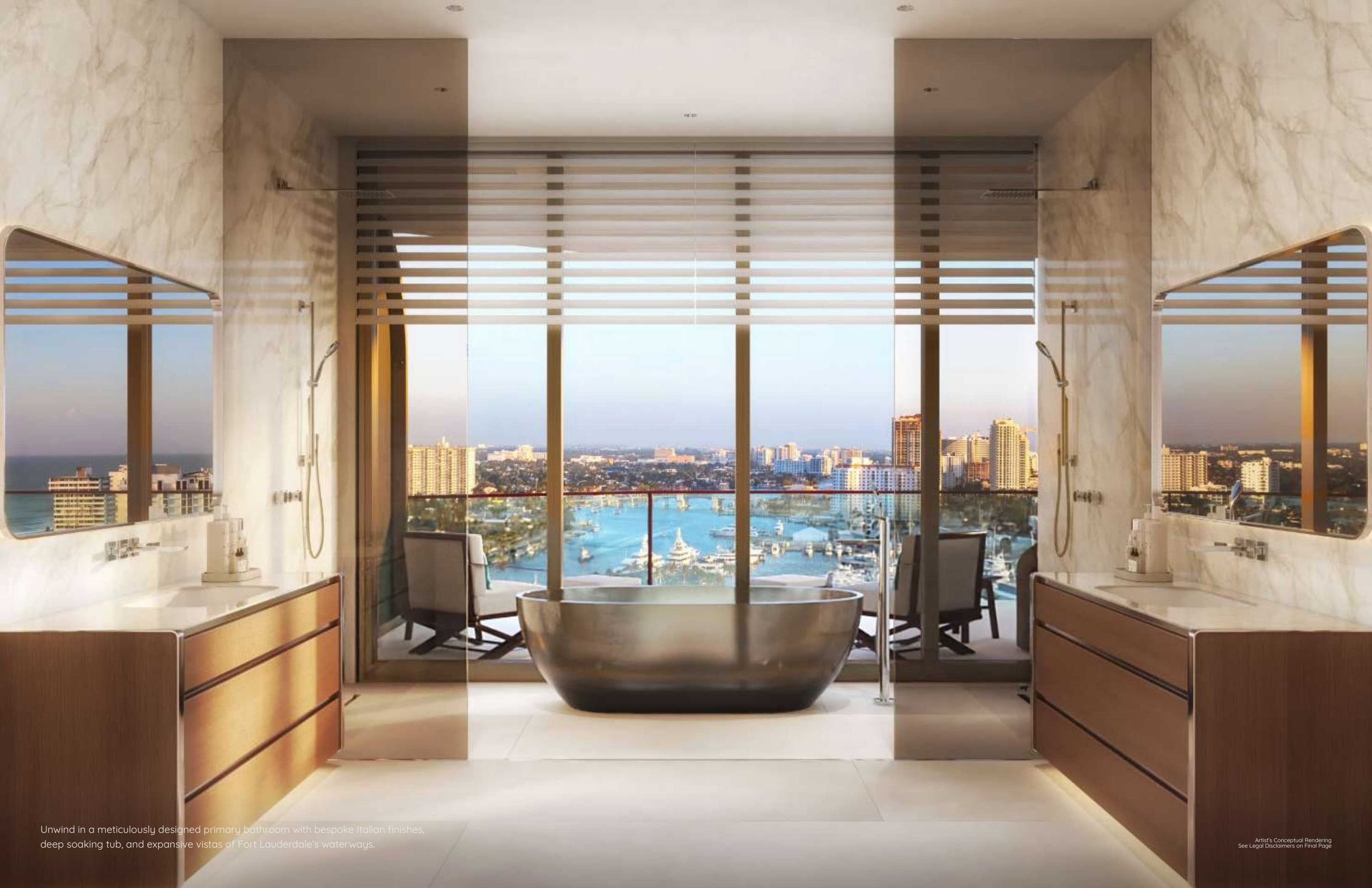
Unwind in a meticulously designed primary bathroom with bespoke Italian finishes, deep soaking tub, and expansive vistas of Fort Lauderdale's waterways.