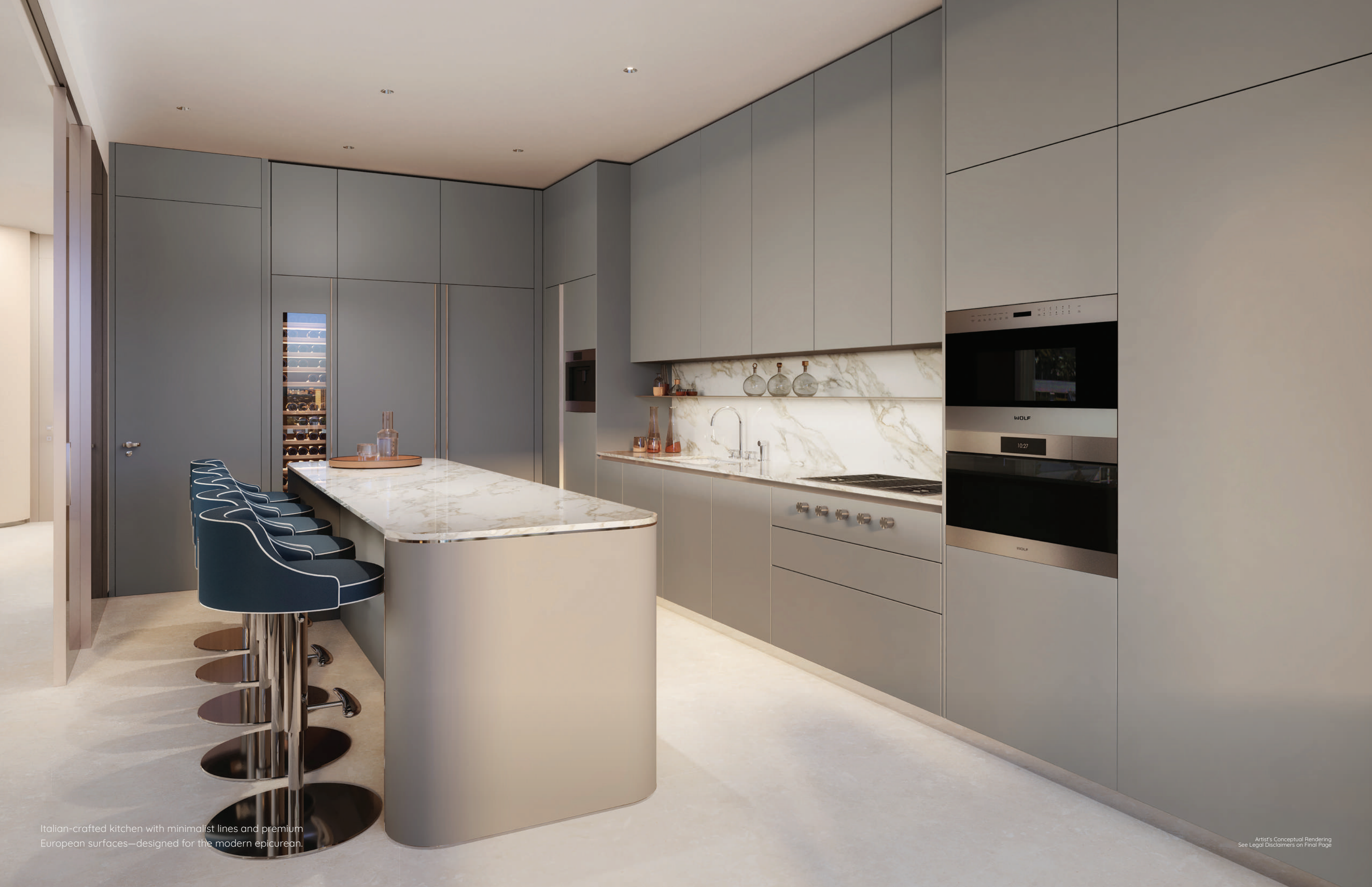
Italian-crafted kitchen with minimalist lines and premium European surfaces—designed for the modern epicurean.