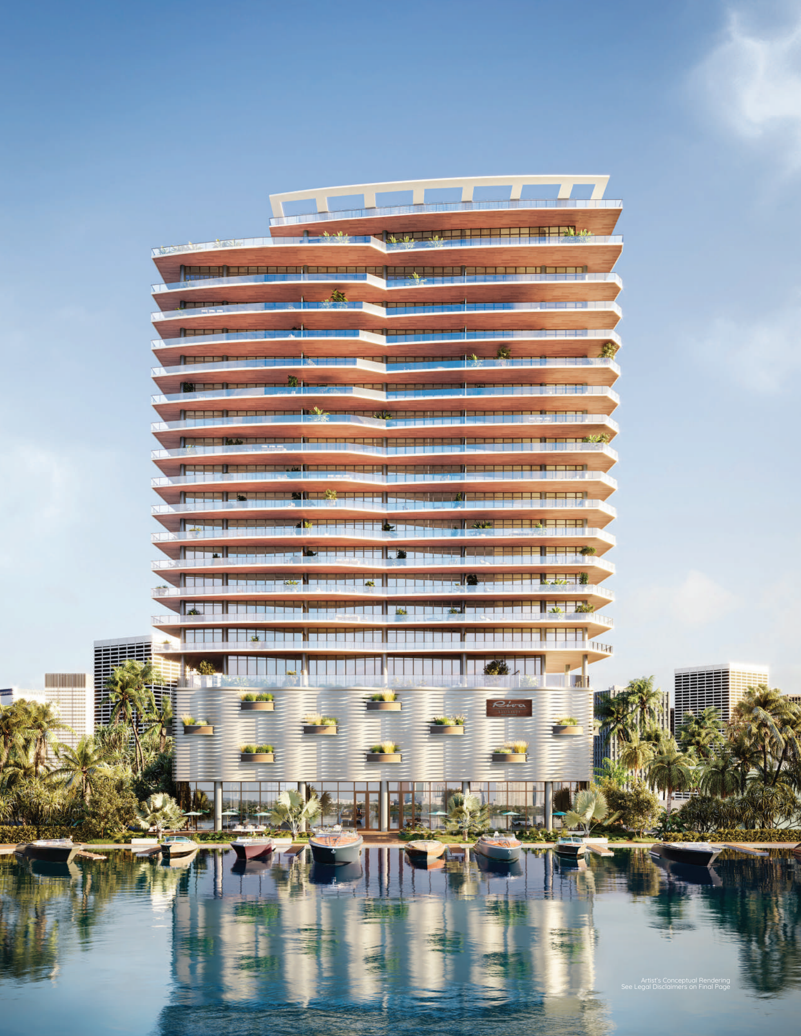
Artist's Conceptual Rendering See Legal Disclaimers on Final Page