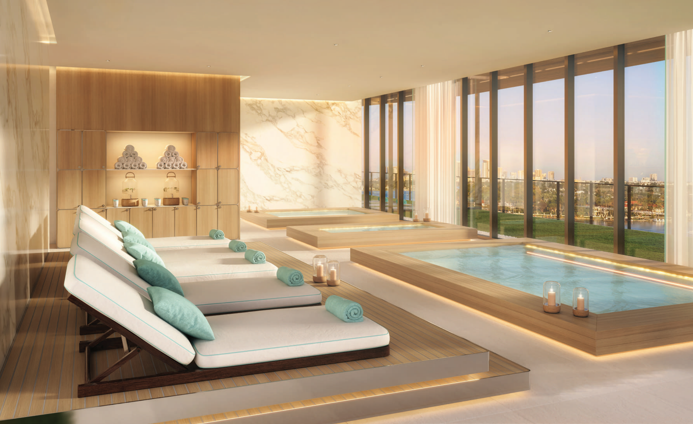
Transformative sanctuary with heated spa, steam and sauna rooms, and bespoke treatments.

With over 20,000 SF of dedicated amenity space, each amenity at Riva Residence is its own point of arrival, thoughtfully designed to create a sense of movement and balance that touches every sense. As with the streamlined, curved interiors of a yacht gliding through water, every space unfolds in a crescendo of experiences—a curated art gallery, a serene garden, a sunrise bar and lounge, a sunlit executive boardroom—all leading up to a tranquil sky lounge and sun deck.